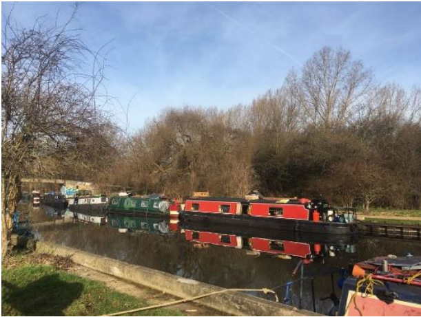
Canal: A waterway that is used by plants, animals and people.