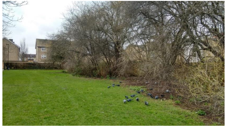
Scrub: A mix of plants, bushes and trees but not as many trees as a woodland.