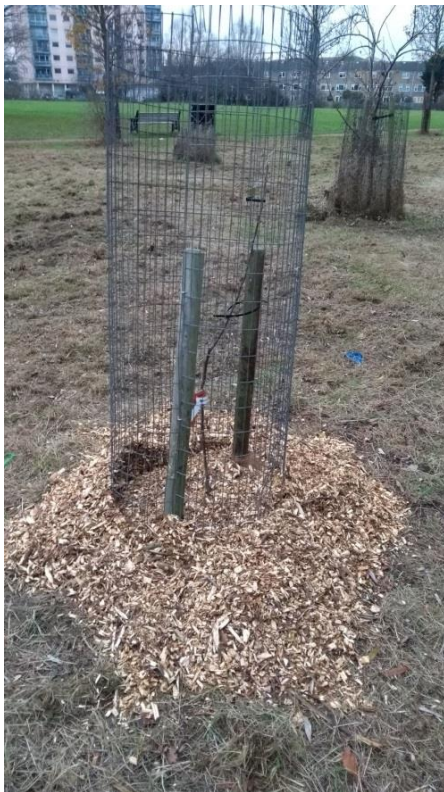
Orchard: A place where fruit trees are planted. These are surrounded by grassland.